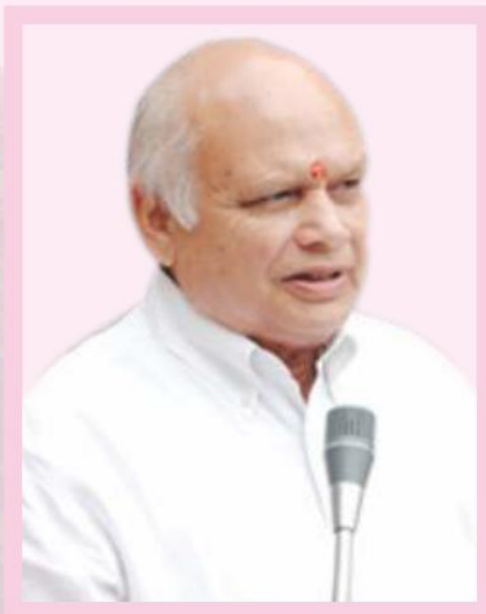
Chairman, Bhavan's Jaipur Kendra

I t is our earnest endeavour to impart to children under our care, value-based education. Our mission is not only to make successful engineers, doctors, professionals, businessmen, etc but also to shape up good human beings of great values to espouse and spread the threefold cherished aspects of Dharma — satyam, shivam and sundaram. I pray for the internalization and universalization of these life-sustaining values.