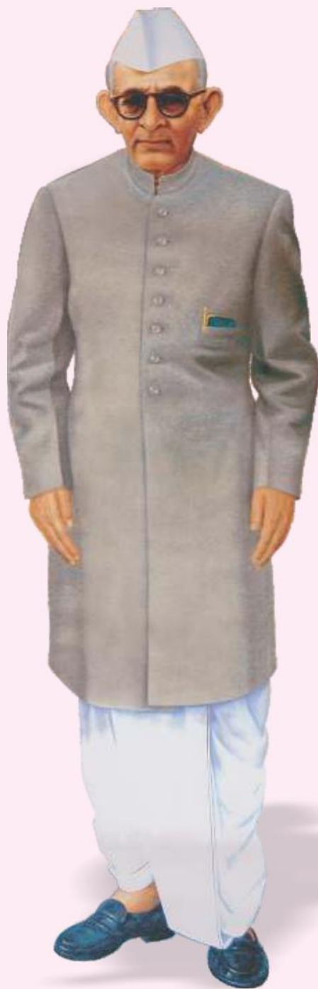
Bhavan's Founder President Kulapati K. M. Munshi (December 30, 1887 to February 8, 1971)

L et me once more set forth the Bhavan's faith for the benefit of new students and members, for it is necessary that they should understand it clearly and imbibe its spirit.