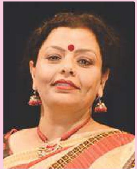
Principal, Bharatiya Vidya Bhavan's Vidhyashram, Jaipur

E arly childhood education assumes great importance because researches across the globe have proved that maximum development of the child takes place up to 5 years of age. At the sub junior wing of the school that is Balwadi, it is our earnest endeavour to provide the right atmosphere for the development of the child's intrinsic capabilities. The approach at Balwadi has been to create an atmosphere of informal learning through a conducive and friendly environment. An amalgamation of core Indian values-as envisaged in Bhavan's culture-with the best contemporary practices is what is sought to be achieved by way of our pedagogy and other domains of teaching learning process. As we strive to live up to the reputation of Bharatiya Vidya Bhavan the world over, we have also made it a point that we compete with none but revise our own benchmarks. With this spirit in mind we undertake to impart the best of early childhood education to our children. We look forward to having a wonderful and enriching experience with you and Our child.