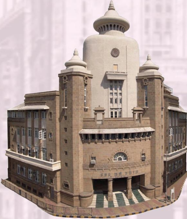
Bharatiya Vidya Bhavan's Head Office at Chowpatty, Mumbai

Let noble thoughts come to us from every side. - Rigveda 1.89-i